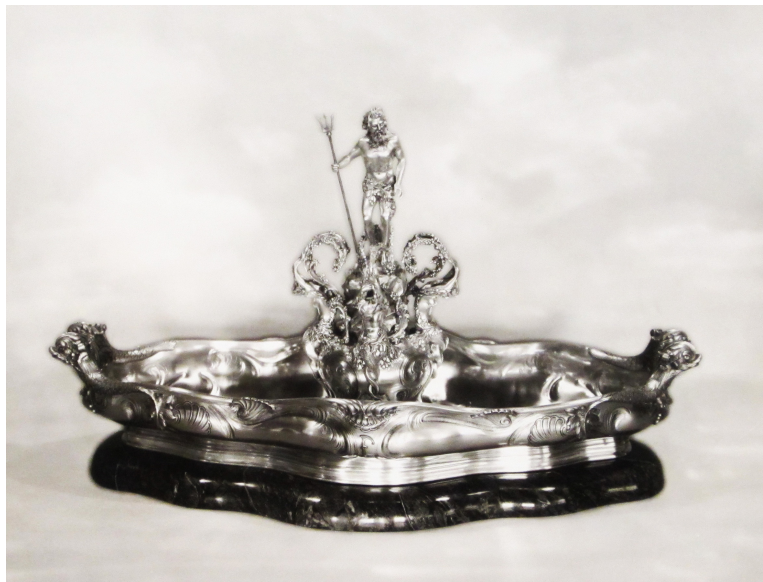
Illustration 1: c. 1929 Custom Sterling (possibly gilt) Centerpiece made for the private Yacht NAKHODA owned by Mr. Fred Fisher (of General Motors -Body by Fisher fame). Custom designed gilt flatware service and hollow ware also made for the yacht along with silver plated serving trays.

One of the hidden benefits of the project is the rediscovery of many unique or unusual items that were in regular production of custom commissions. While many of the mass produced pickle castors, flatware patterns and hollow ware items are frequently seen on websites or in personal collections, some items are rarely if ever seen. Whether custom made pieces or ones intended for a singular use, they were all lavished with the same attention to detail. The quantity, quality and diversity of the articles produced is simply amazing and there seems to be no end to the variations exhibited in the catalogs. Selecting just a few items to include here was difficult but hopefully these will give a taste of things to come.