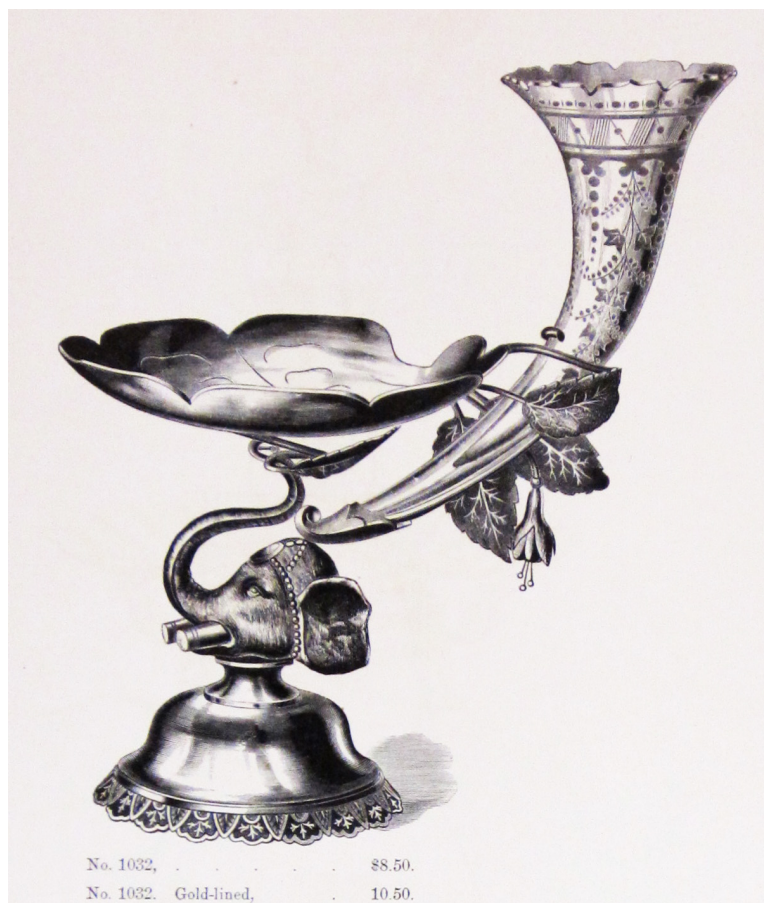
Illustration 3: 1879 Meriden Silver Plate Co. Card Receiver